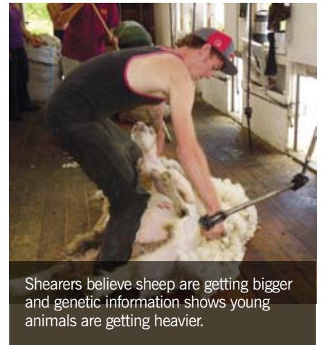
Shearers believe sheep are getting bigger and genetic information shows young animals are getting heavier.

In 1960 sheep farmers exported 71% of wool as opposed to 29% of sheep meat. By 2010 the situation had reversed – only 16% of wool production was being exported compared to 84% of sheep meat.